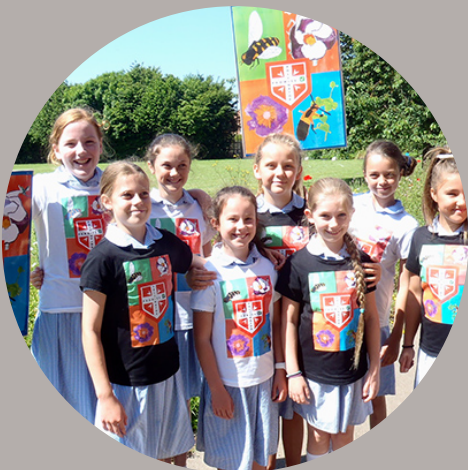
St Alban's C of E School Campaigning for their Pollinator Promise

Letting your friends, family and others in your community know about a cause that you're passionate about can make a real difference.